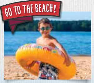
SWIM ON 2 lakes at 4 different beaches