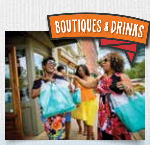
r, sip, shop, & stroll through historic main street