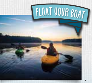
Paddle around Lake Acworth in a kayak or on your SVP