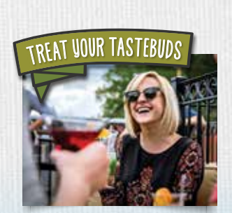
Experience the many flavors of Acworth

From casual tavern vibes and great live bands to outdoor patios, games and firepits, Acworth has you covered. And downtown's open container district is ideal for spending an evening sipping, strolling, and exploring all this charming town has to offer.